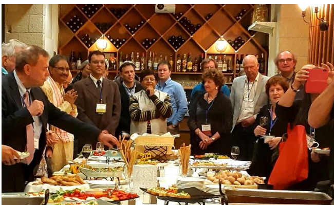
(Above) Joy and celebration; Jerusalem 2019