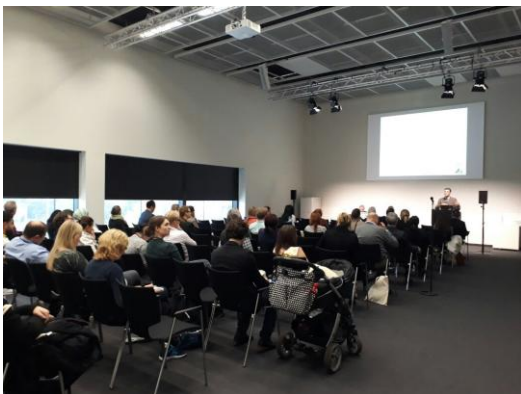
Symposium: Culture, religion and spirituality in the promotion of mental health and management of mental illnesses