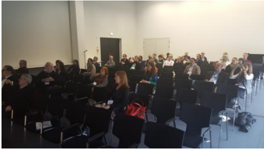
Symposium: Culture, religion and spirituality in the promotion of mental health and management of mental illnesses