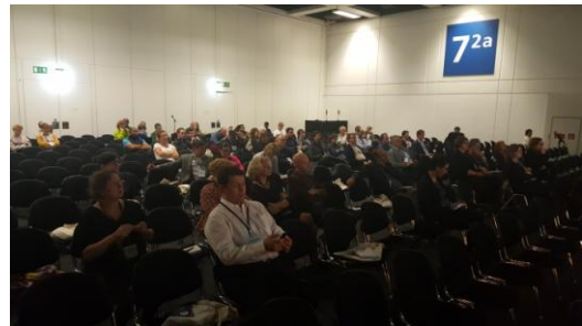
Symposium Religion, spirituality and clinical psychiatry: empirical studies